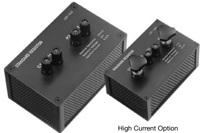
High Current Option

The spacing between voltage terminals is 19.05 mm.